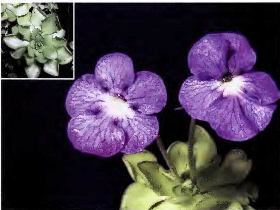
Figure 7: Pinguicula 'Enigma'; summer foliage in inset.